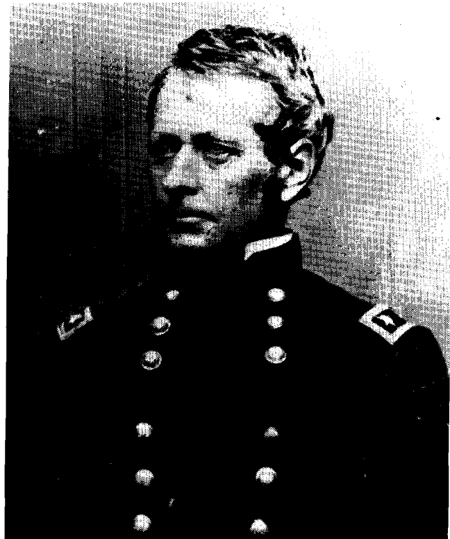
Maj. Gen. Joseph Hooker