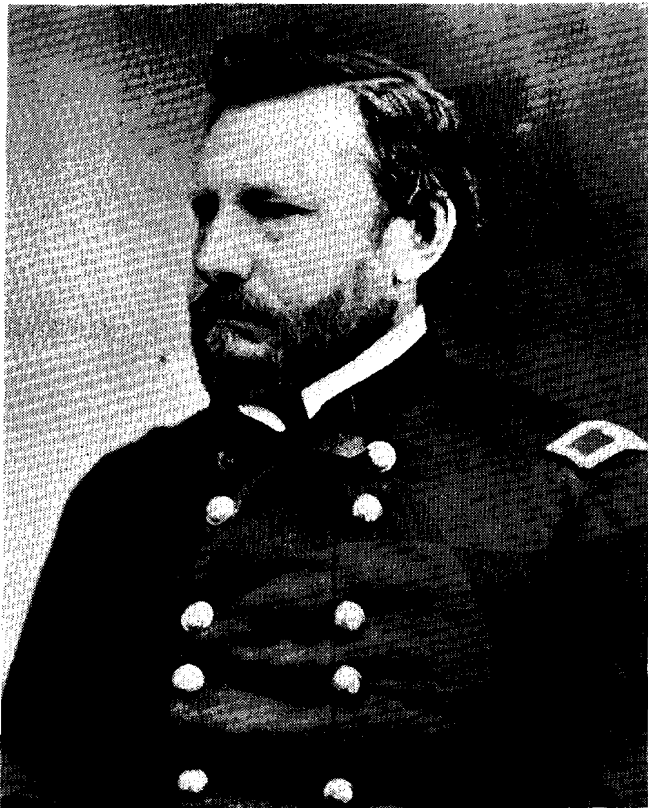
Col. Albert J. Myer