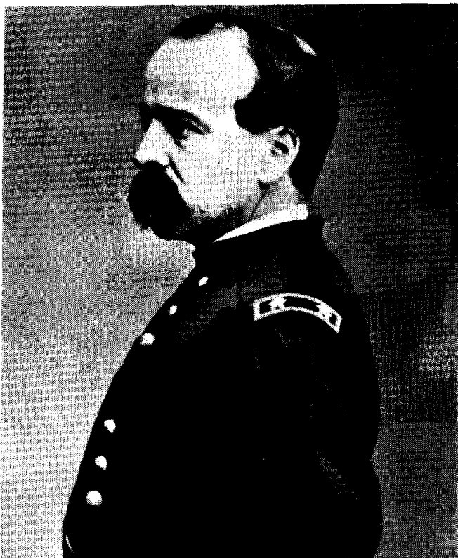
Maj. Gen. Daniel Butterfield

Against staff advice favoring an attack downriver, below the point of Burnside's main thrust, Hooker decided to move against Lee's left (upriver) wing. He would send his cavalry far around the Confederate left to break the Richmond-Fredericksburg railroad. If both halves of the scheme worked, or even if only the first half worked, he might, by getting in Lee's rear, bag virtually the whole Army of Northern Virginia.