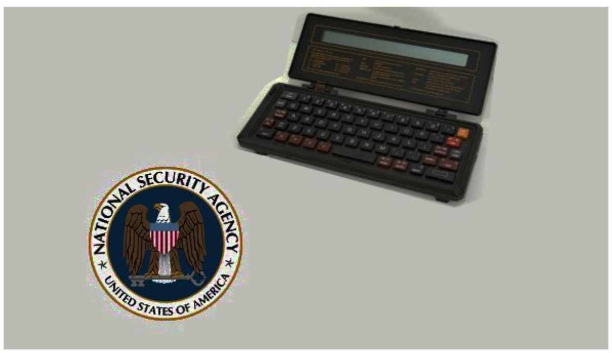
NSA Logo + PS1000 mashup by Klaus Schmeh