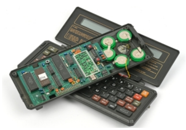
PX-1000 internals NL Crypto Museum.jpg

Since the covert effort to prepare Nelson Mandela for freedom and return to active politics (in parallel with negotiations) was organized from Netherlands (with Comms center in London), PX-1000 units were used.