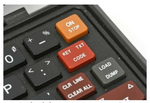
red-code-button - Crypto Museum.jpg