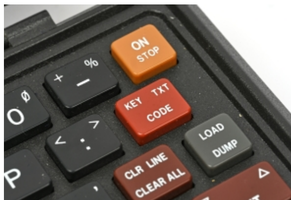
red-code-button - Crypto Museum.jpg