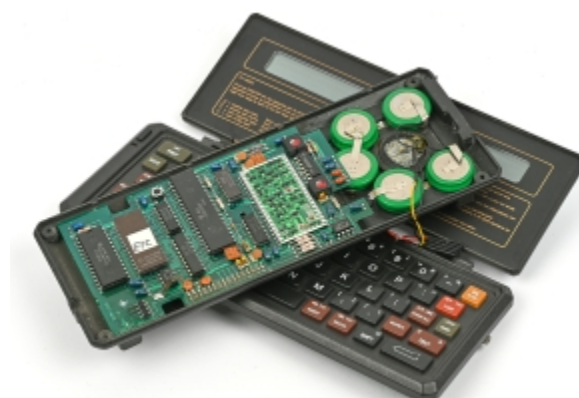
PX-1000 internals NL Crypto Museum.jpg