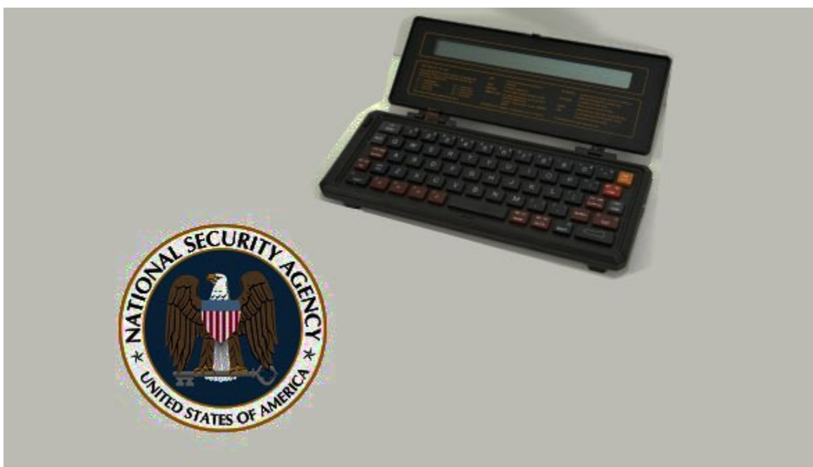
NSA Logo + PS1000 mashup by Klaus Schmeh

Text Lite “pocket telex” / pocket teletype